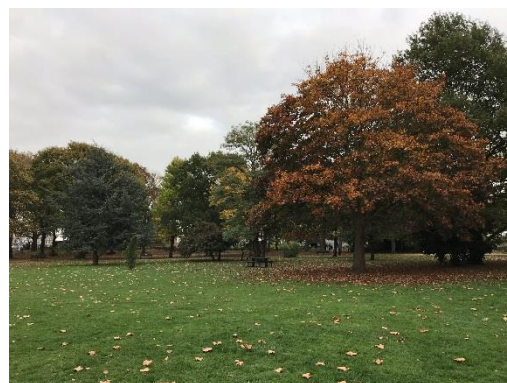
Canonbury Park, Islington